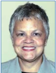
Assembly Majority Leader Bonnie Watson Coleman (D)